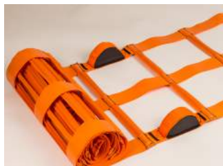
STAND OFFS, TO BRING THE LADDER AWAY FROM A FLAT SIDE